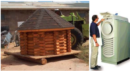
(Product of Indigenous Community Ventures & Example of a 30 kW Microturbine)

This project is funded by the State of Arizona through the Department of Energy's NICE 3 program, and matched with support from the National Rural Electric Cooperative Association. The Energy & Environmental Research Center (EERC) at the University of North Dakota (UND) has been subcontracted by Flex-Energy, the developer of the Capstone Flex-Microturbine™ to provide a trailer mounted biomass gasification system. The demonstration project will be located in Cameron, AZ on the Navajo Reservation at a log home manufacturing site. The site is owned by Indigenous Community Ventures (ICV) who utilize typically low value round wood to manufacture their product.